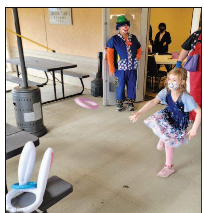
Ring toss on the bunny ears at the Zenobia Children's Easter Party.