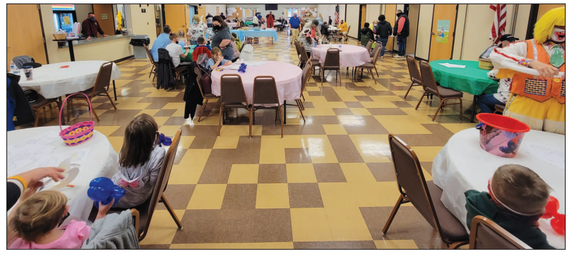
Great attendance at the Zenobia Children's Easter Party! Special thanks to the Findlay Clowns who came up to entertain the children with balloons!