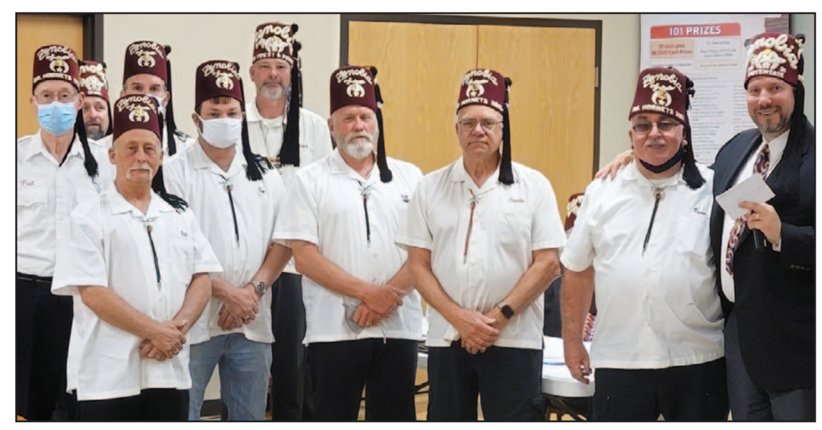
Tiffin Hornets posted the colors at the April Zenobia stated meeting as the featured unit. They also donated to the Benevolent Fund.