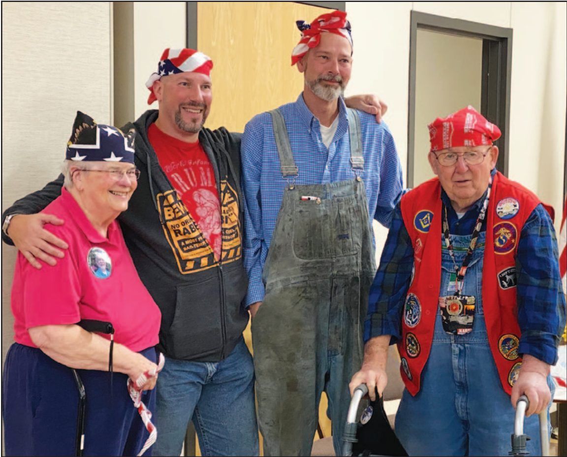
Winners of raffle.