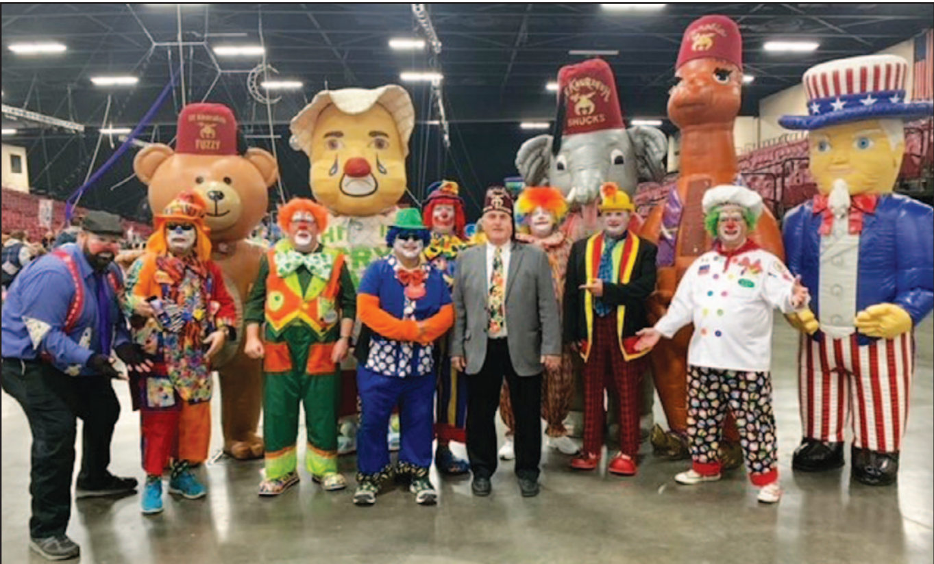
The tall Shriners and clowns drew much attention from our younger (and experienced) attendees.