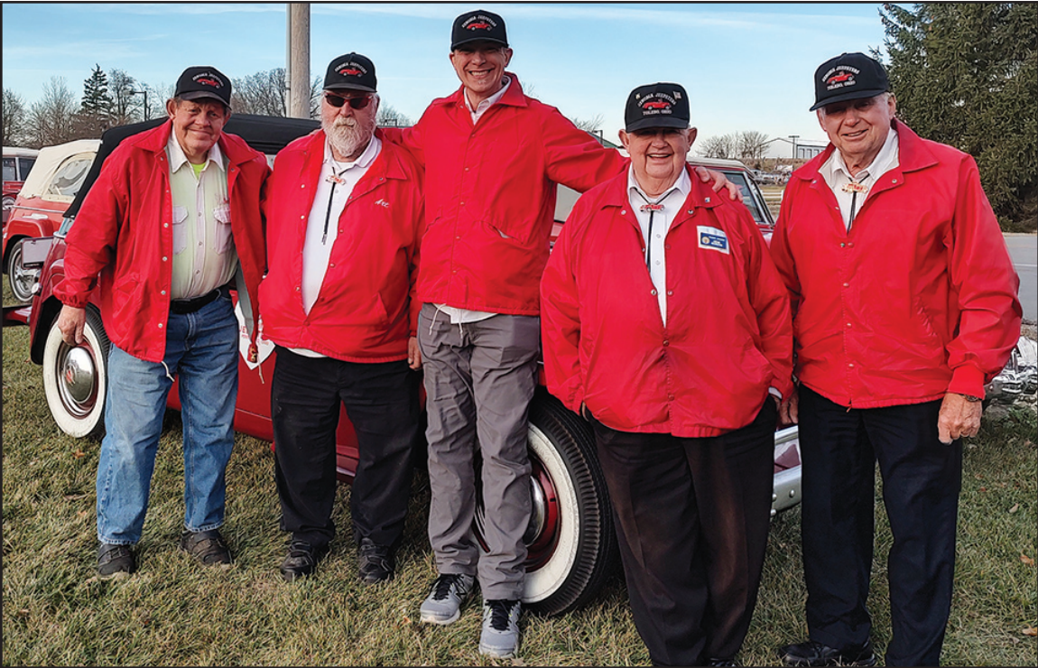
Jeepsters at Bluffton Parade of Lights.