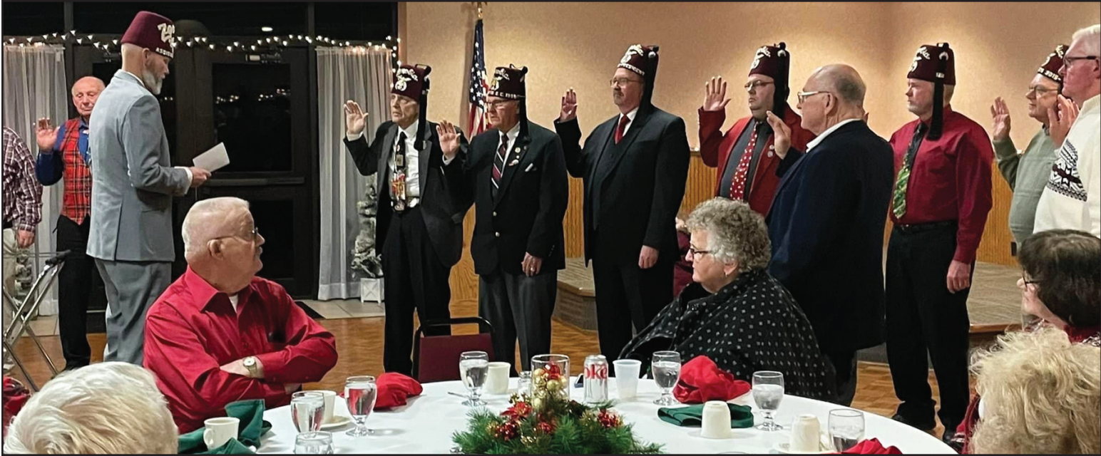
Installing the officers of Tiffin Shrine Club, the Hornets, the Jeepsters, and the Camper unit.