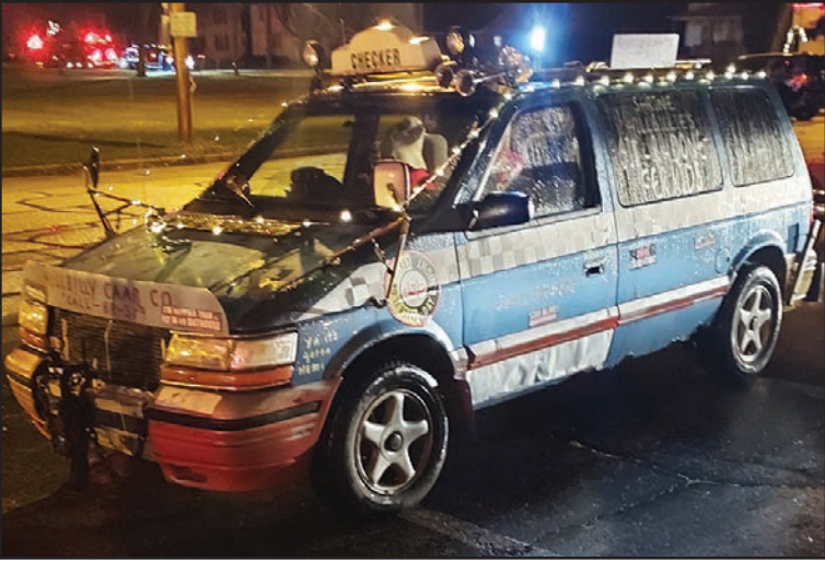
Hillbillies at Pemberville lighted parade.