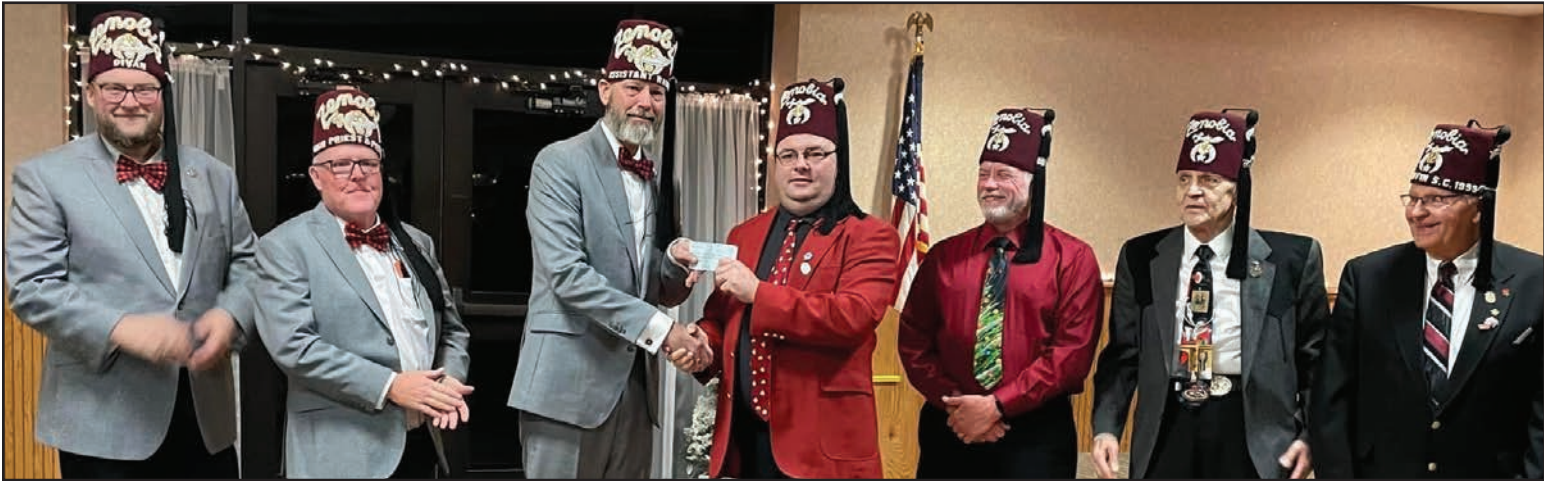
The Tiffin Hornets presented a $1,000 check to Zenobia's Transportation Fund.