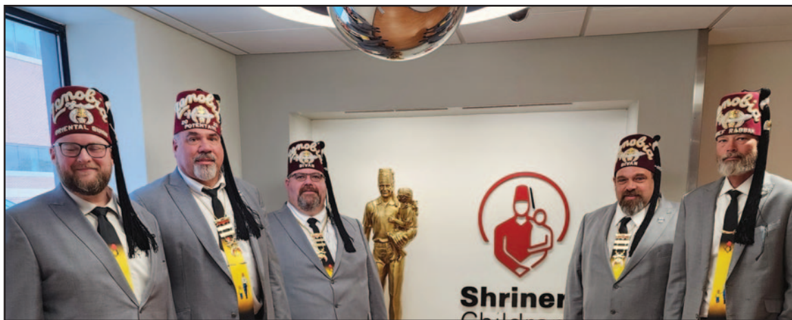
Divan at Shrine Children's Ohio Hospital