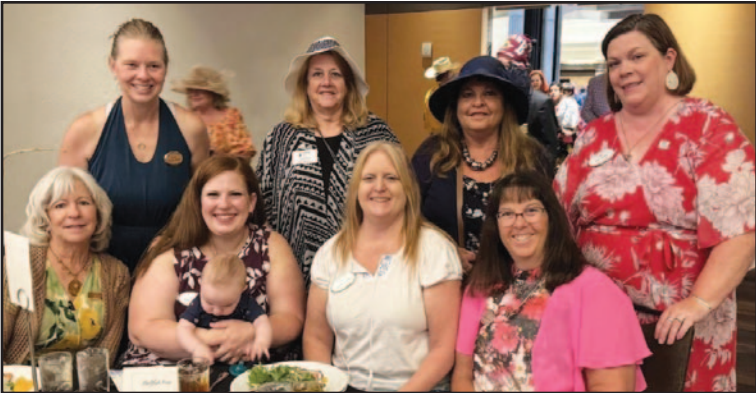
Our Ladies who traveled to Imperial Session pose for a photo before the banquet.