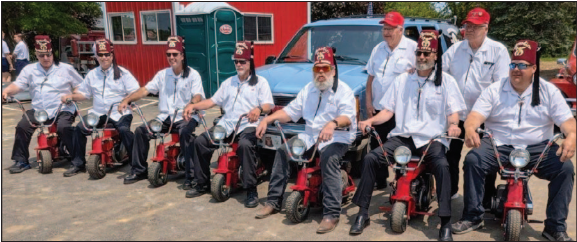
Tiffin Shrine Hornets swarmed into Bascom for the annual Memorial Day Parade on June 1.

The Safe Halloween committee is seeking assistance to make the event on Sunday, October 26, 2025 a success.