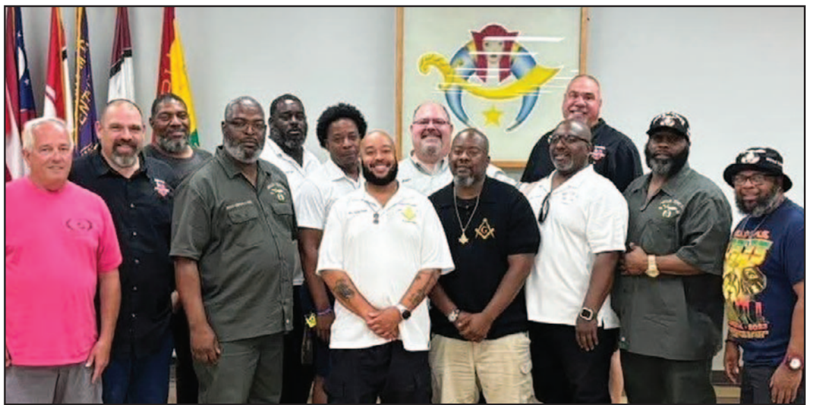
Our friends from Mecca Temple #43 AEONMS visited our summer cookout hosted by the Zenobia Pitmasters.