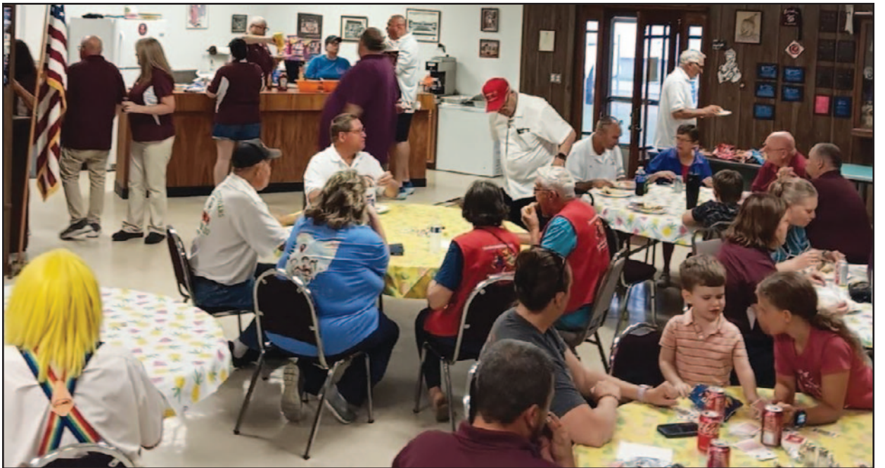
The Findlay Clown's clubhouse was packed for the afterglow they hosted after the Potentate's parade.