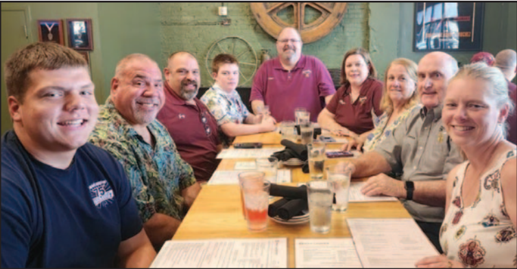
Divan officers and family gather for dinner after a day at Imperial.