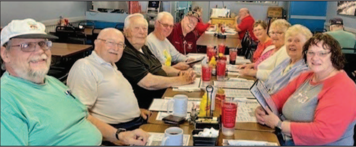
Campers at Clinton Lake.