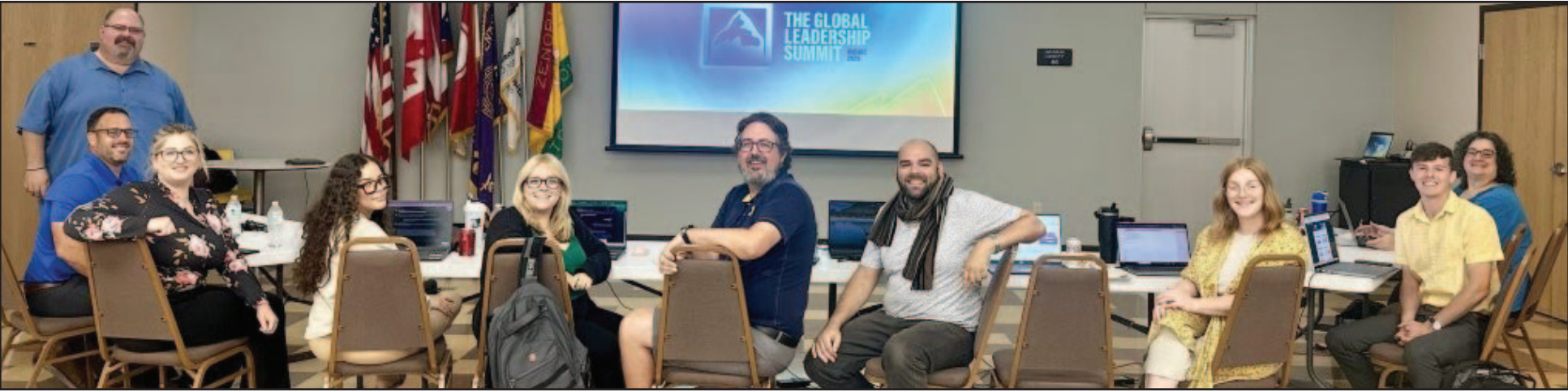
Double A Solutions has a business meeting at the Shrine watching the Global Leadership Conference Simulcast. You can too! Call the office to reserve space for your business meetings.