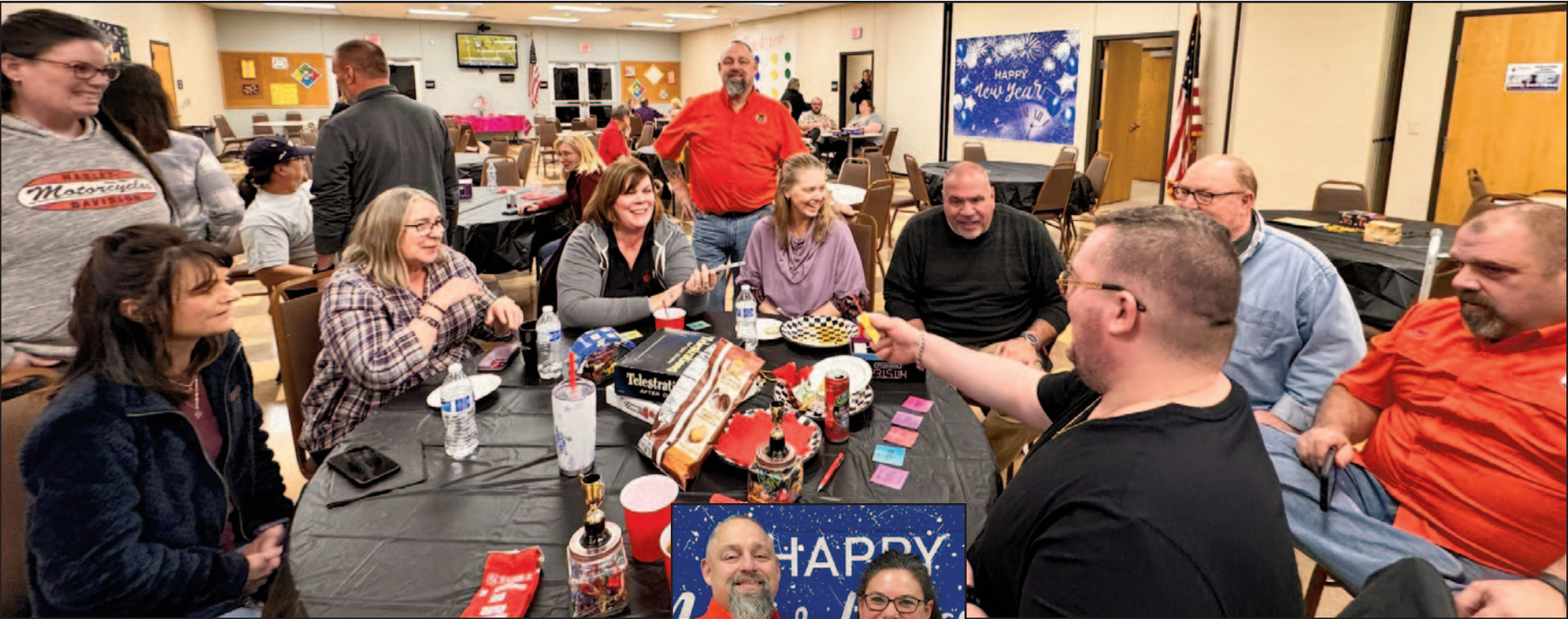
Above: group game at New Year party.