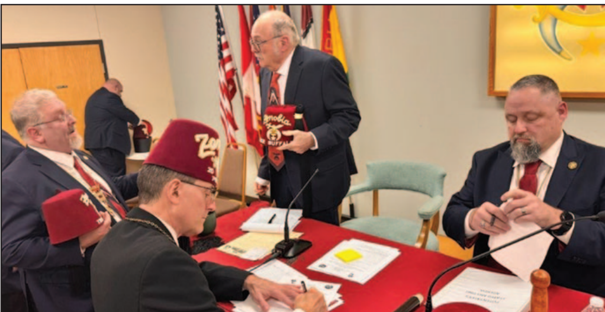
Potentate and Divan hard at work at interstate meeting.