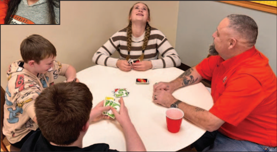
New Year party games.