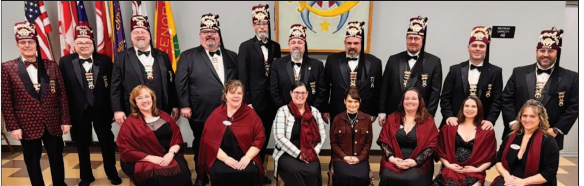
Newly elected officer line and their ladies.