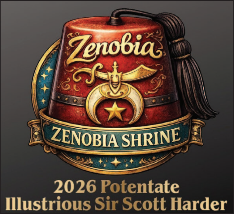
New Facebook logo 2026.